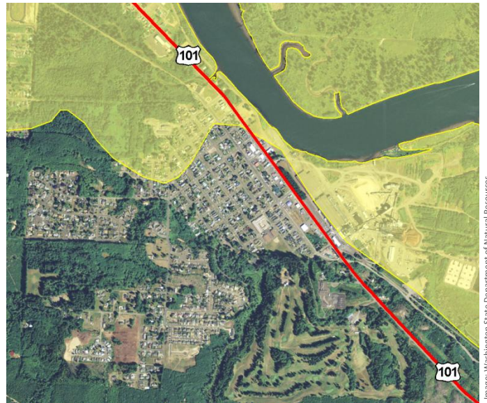
Figure 1. Aerial view of the community of Cosmopolis on the Chehalis River. The tsunami hazard zone is shaded in yellow. Highways are marked by solid red lines. The river empties into Grays Harbor (not shown) just west of Cosmopolis.

All coastal communities along this zone, which extends from northern California to southern British Columbia, will be impacted by the next earthquake and tsunami. The zone has produced earthquakes measuring M8.0 and above at least seven times in the past 3,500 years. The intervals between quakes vary: from as little as 140 years to as much as 1,000. The last one occurred just over 300 years ago. Although scientists cannot predict when the next earthquake will occur, the region is within the window for a significant event.